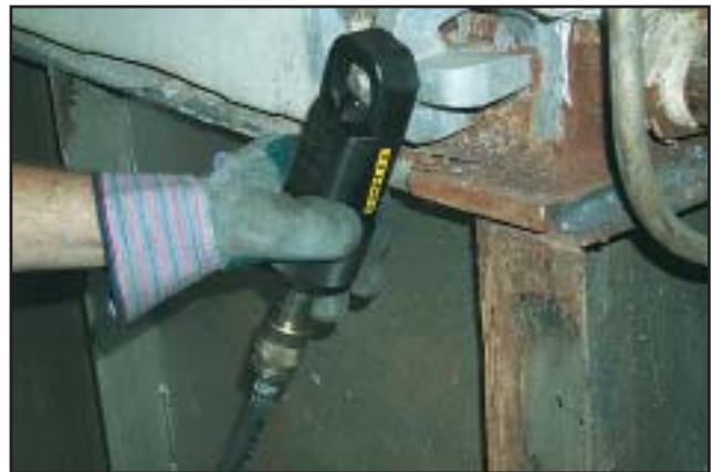
Refineries, steel mills and power plants rely heavily on Simplex nut splitters for removing stubborn or rusted nuts easily and safely. The Simplex nut splitters offer a wide range of sizes at exceptional values.