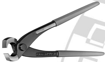
Narrow Jaw Pincer No. 14100117