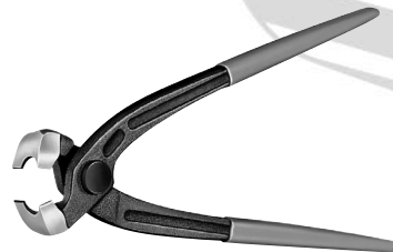
No. 14100085 Without adjustable closure stop (not shown). Side Jaw Pincers No. 14100083