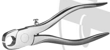
Miniature Clamp Pincer No. 14100120 Stainless Steel with adjustable closure stop for clamps up to 7mm diameter.