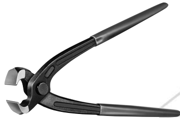
Standard Pincer No. 14100082

OETIKER Swing Couplings SC interchange with most common plug systems, providing a universal and flexible connection. The quality and reliability of the products have been officially certified.