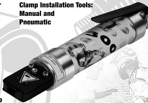
Clamp Installation Tools: Manual and Pneumatic