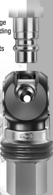
Note: Patented Products

Internet: www.oetiker.com www.oetiker.com