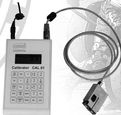
OETIKER Electronic Force Gage