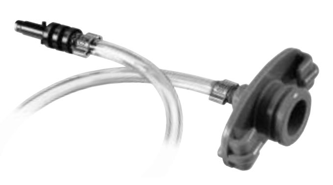
2-Ear Clamp provides a strong leak-proof seal on dispensing equipment component.