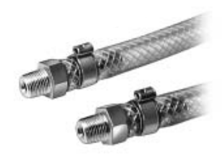
OETIKER 1-Ear Clamps with insert are designed for demanding, difficult to seal nylon or wire braided hoses or tubing.