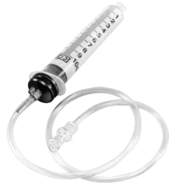
Miniature 1-Ear Clamps with insert ensure a positive seal on this high vacuum application.