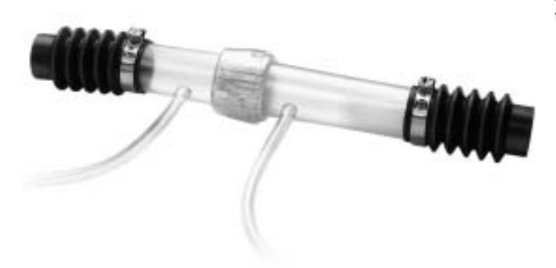
OETIKER Ear Clamp maintains a 360° seal on this critical component for a medical breathing device. Quick, positive seal without damaging delicate plastic.