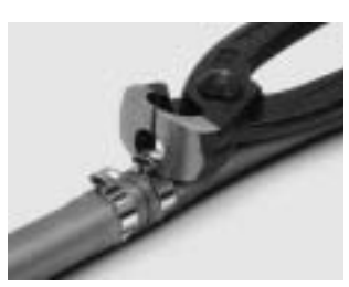
use of side jaw pincers held parallel to hose