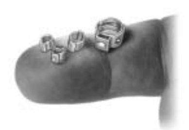
OETIKER Miniature Clamps smallest closure is 2.5 mm / .098"