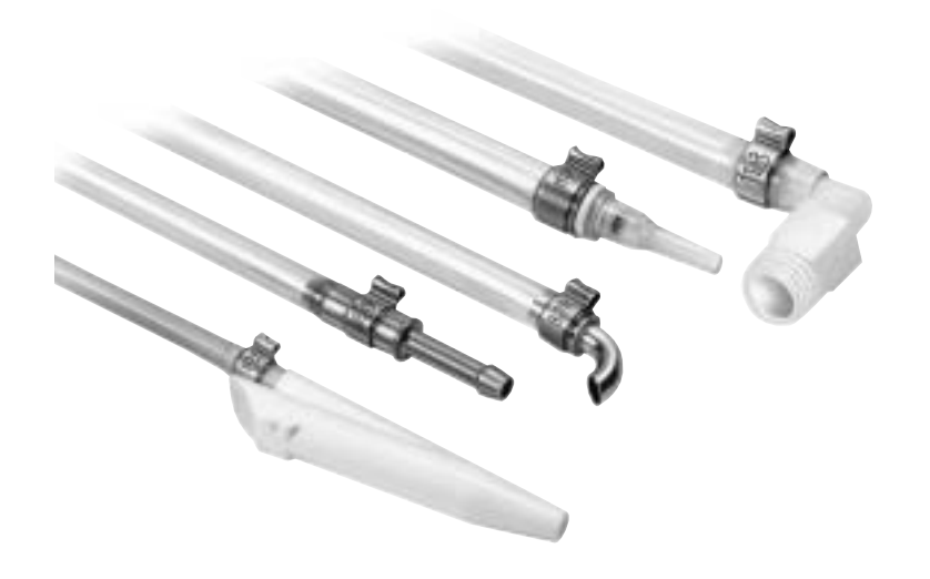
OETIKER Clamps provide a strong, tamper resistant seal that will not damage medical / pharmaceutical or food and beverage grade hose and tubing.