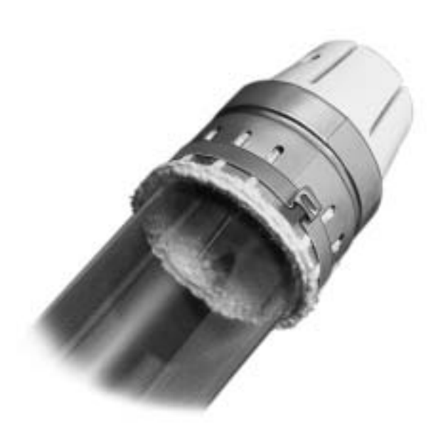
1-Ear Clamp securing a plastic cap onto a fabric buffer and quartz glass tube. Strong seal, yet will not crack the quartz tube.