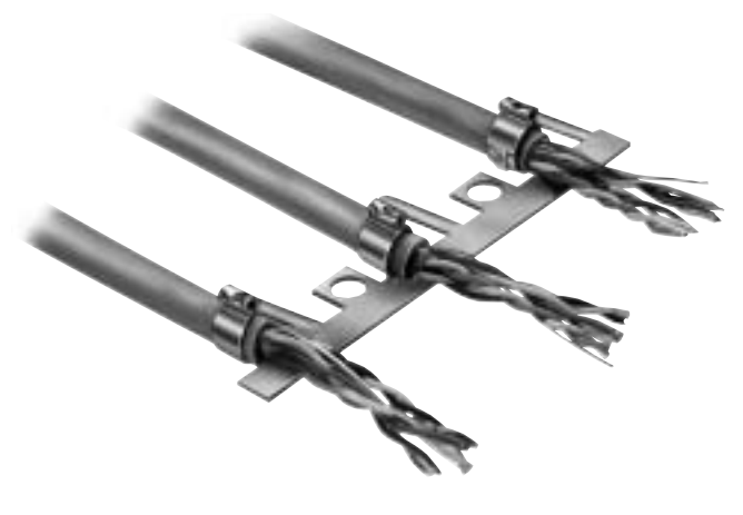
1-Ear Clamp provides strain relief on multi-conductor electrical cables