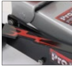
Rolled Side Frame