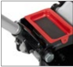
Magnetic Tool Tray