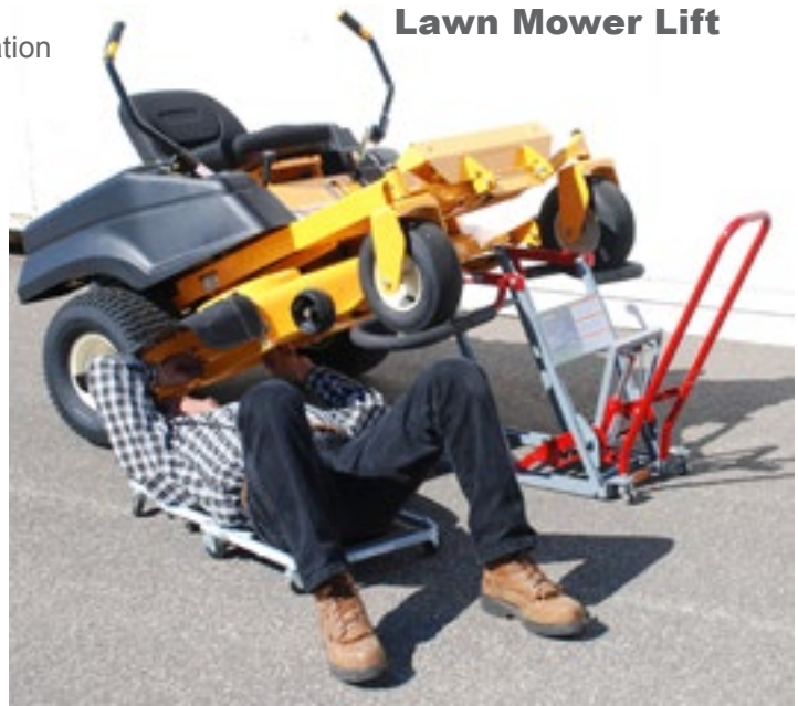
Lawn Mower Lift