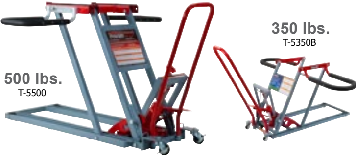
500 lbs. T-5500